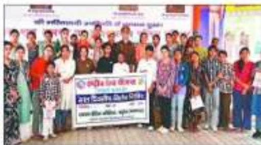
प्रथम सत्र के लिए पूर्वोक्त उजाला वैदिक कॉलेज की छात्राएं।

प्रथम सत्र में छात्राओं ने बोलचाल में मिशन शक्ति केंद्र का धारण किया। यहां छात्राओं को नारी सशक्तीकरण, महिला सुरक्षा में संबंधित ज्ञानकारी दी गई। सहभार जलराध व सन्धान के बारे में बताया गया कि अनजान संवदी से अपने घाले मैरिज, लिंक व एपैक फलल