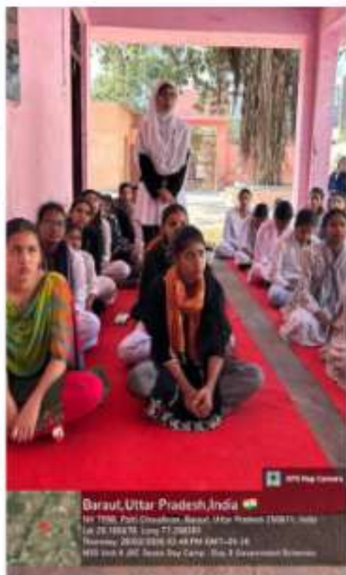
Baraut, Uttar Pradesh, India lat 26.95, long 81.05, alt 200m Monday, 20:42:2025 02:49 PM GMT+05:30 NSS Unit & NSS Seven Day Camp - Dis. & Government Scheme