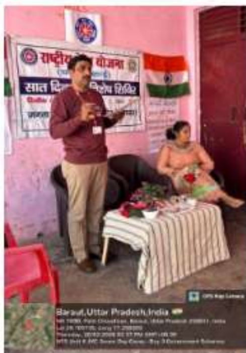
Baraut, Uttar Pradesh, India lat 26.95, long 81.05, alt 200m Monday, 20:42:2025 02:33 PM GMT+05:30 NSS Unit & NSS Seven Day Camp - Dis. & Government Scheme