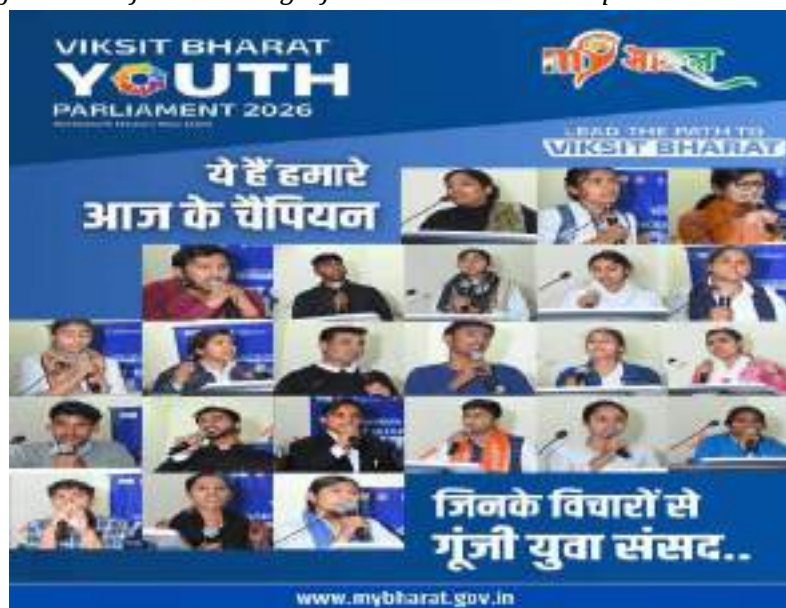
Glimpses of Viksit Bharat Youth Parliament 2026: Students actively expressing their views and contributing to discussions on national issues and democratic values